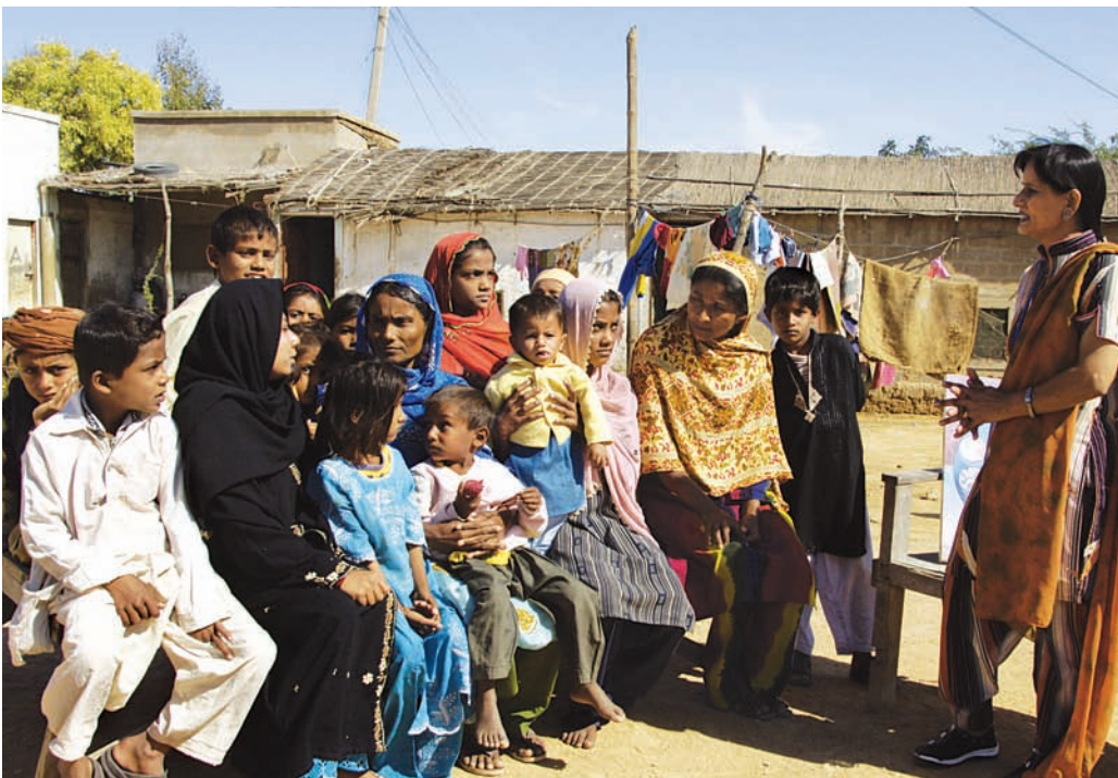
Basic health awareness session in the Rehri Goth katchi abadi.