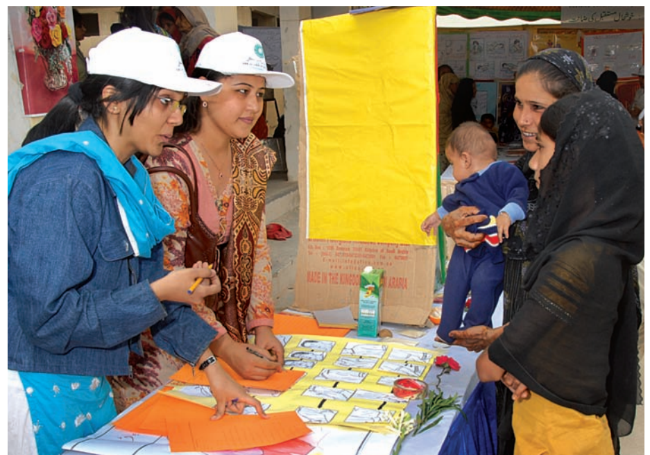
Alumni serving at the camps.