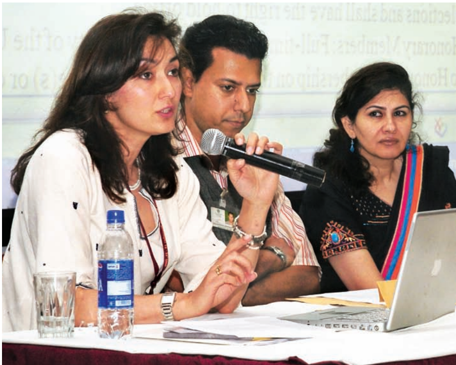
Alumni representatives of the different AKU entities engaged the general alumni body at a session which focused on a new Alumni Association Constitution.