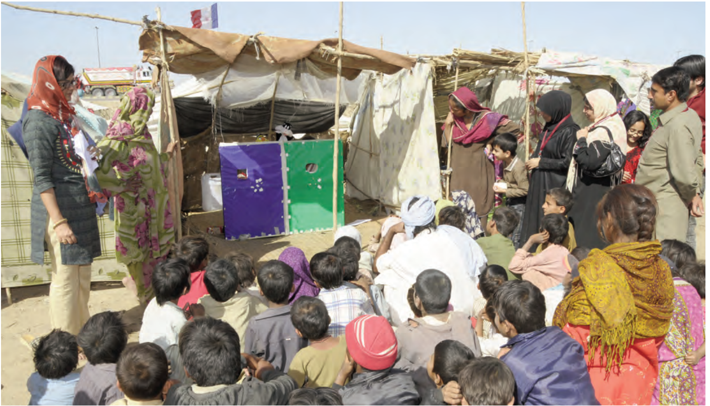
Top: Children enjoying a puppet show at an AKU alumni health camp.