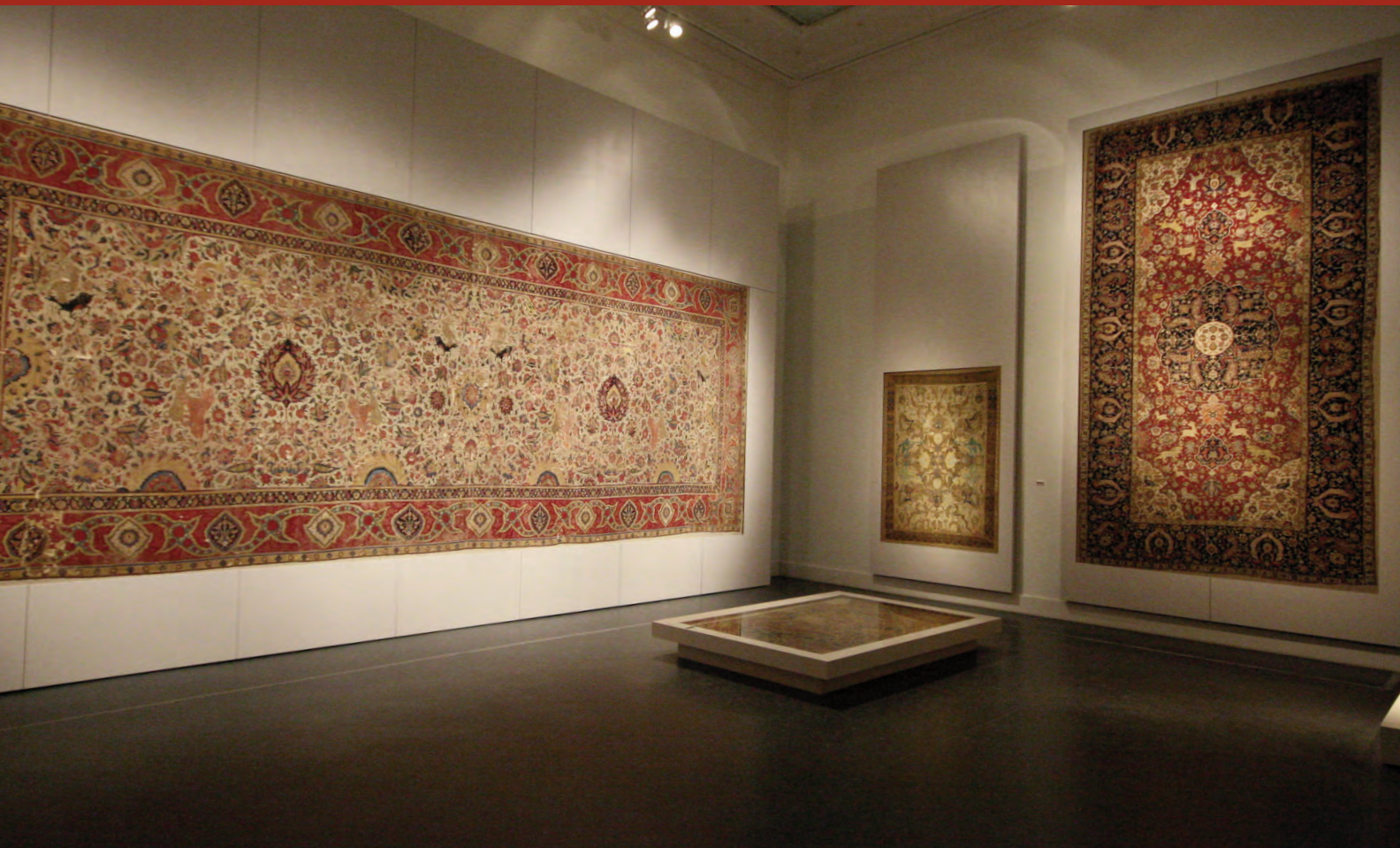
Indian and Persian carpets, 16th / 17th centuries.