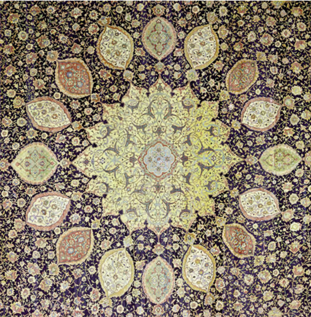
The Ardabil Carpet (detail), Iran 1539-40.