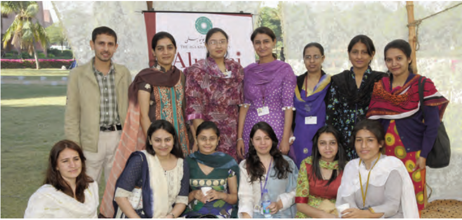
Nursing alumni at the Alumni Reunion, December 2010.