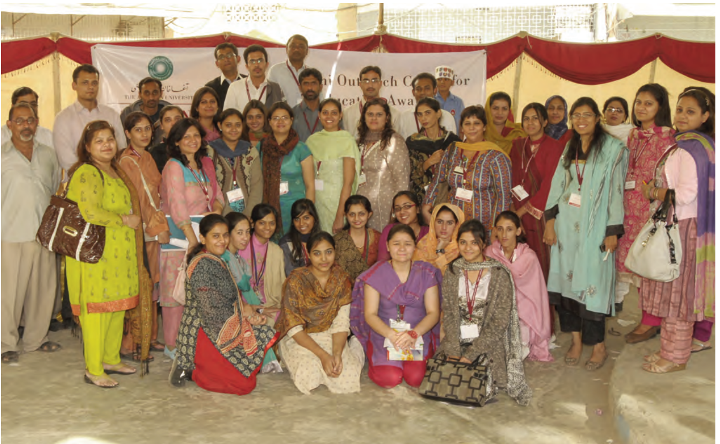
AKU alumni with support staff at Sultanabad camp after serving the community.