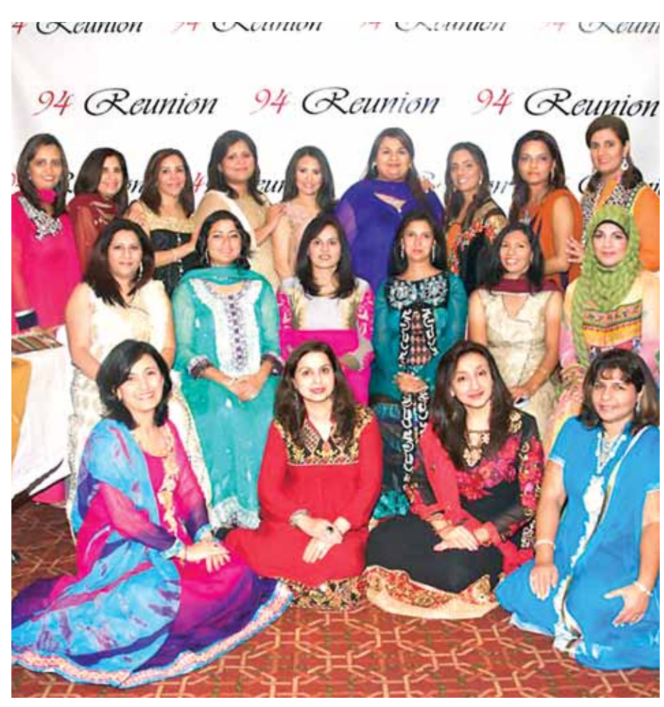
Diploma in Nursing, Class of 1994 reunites in Houston after 20 years

Those of us living in Houston took on the responsibility of organizing everything for members visiting from elsewhere. Eighteen girls (nurses would perhaps be more appropriate) from our class came