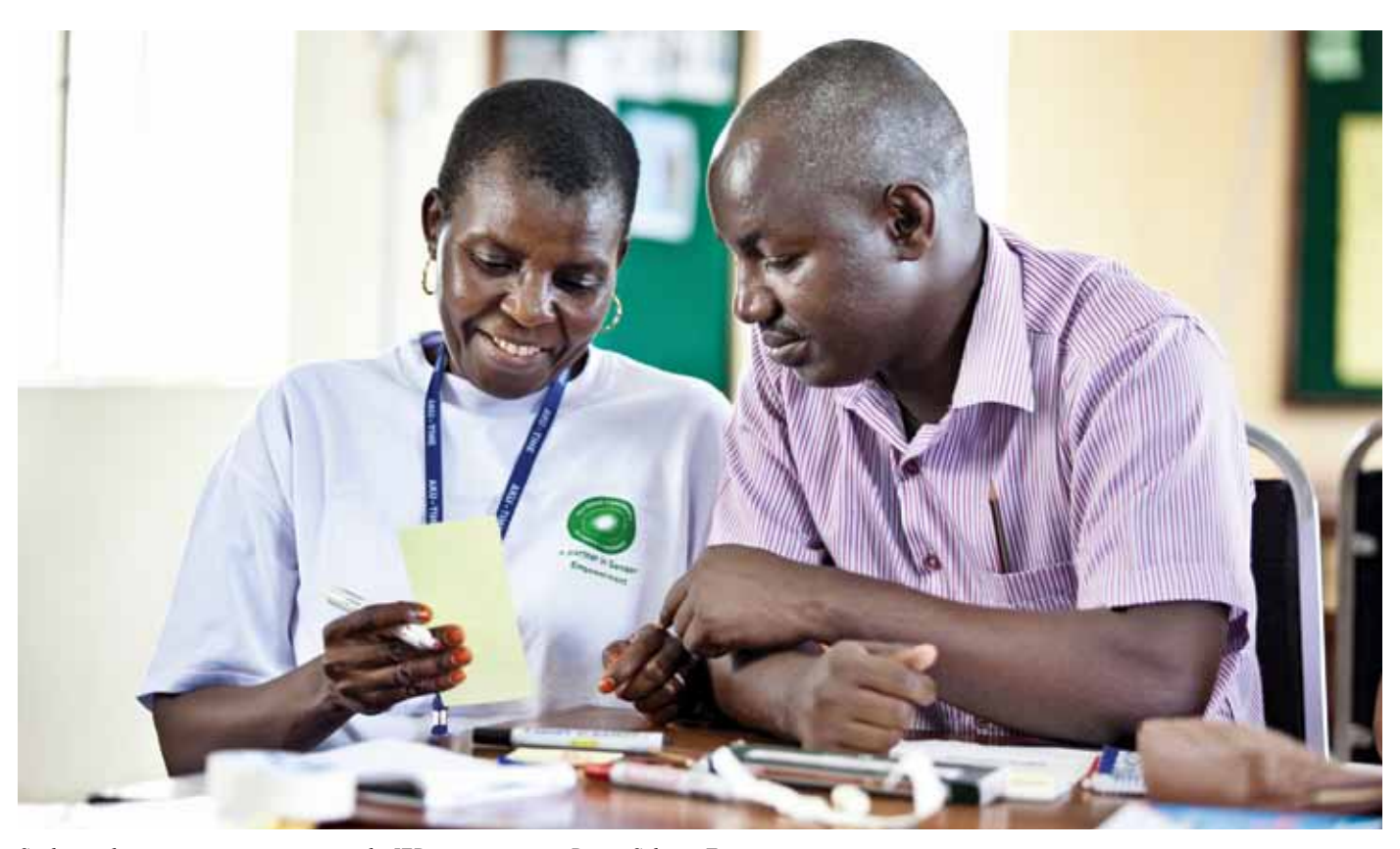
Students take part in various courses run by IED at its campus in Dar es Salaam, Tanzania