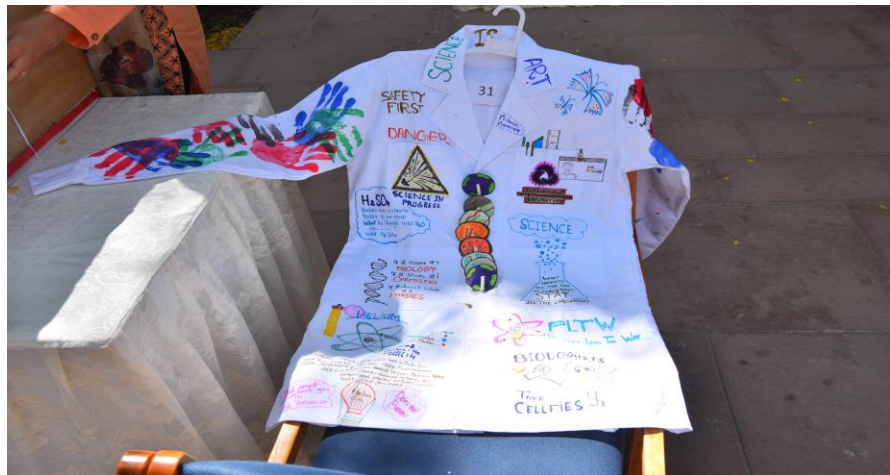
Lab coat model by Clinical Chemistry

Department of Clinical Laboratory won the best 3D model award. Their work focused on representation of medical laboratory technologists and their working routine.