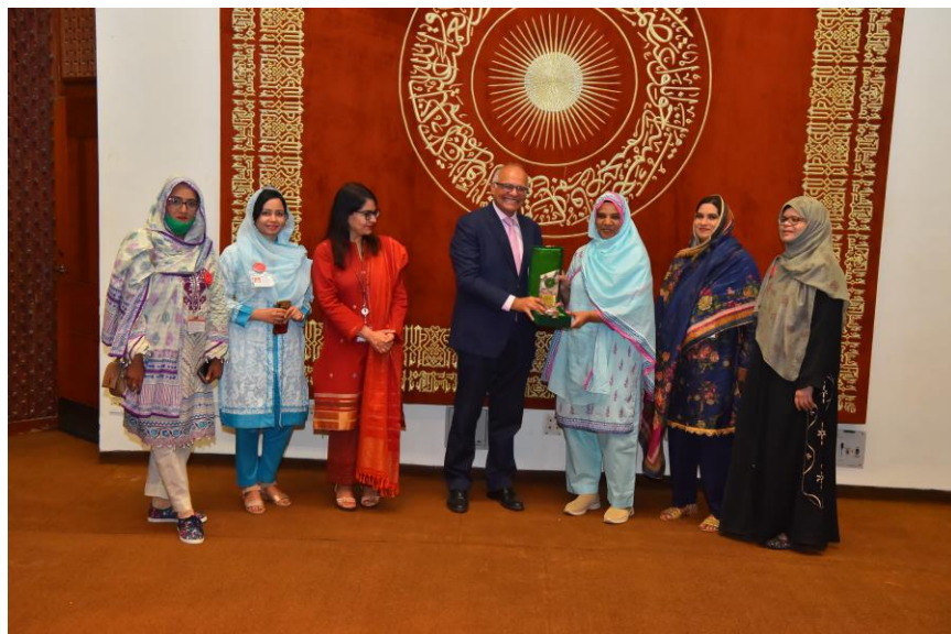
Department of Clinical Laboratories, Section Clinical Chemistry team