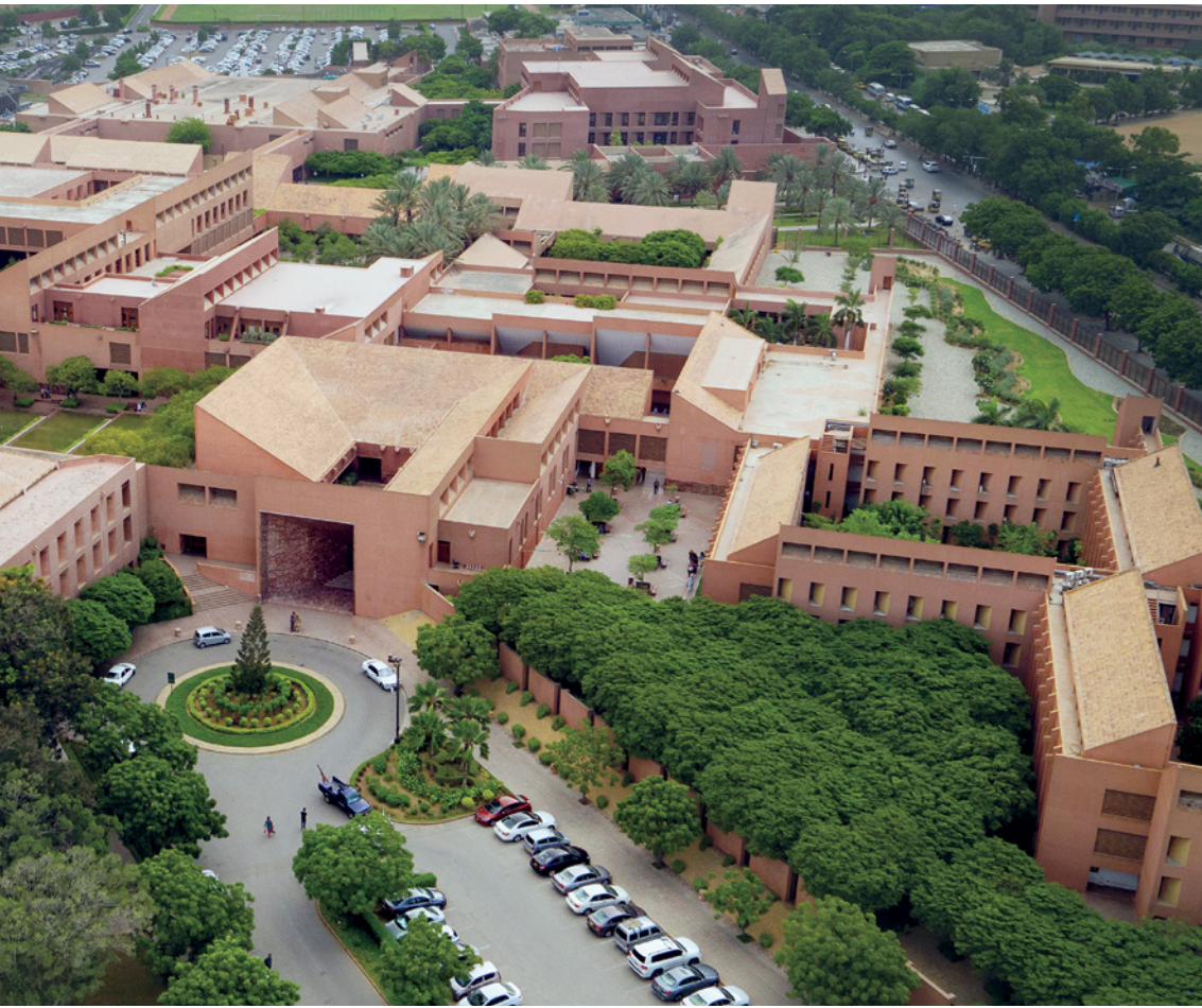
5 The Institute for Educational Development, Pakistan, which provides graduate-level education for teachers and educational leaders.