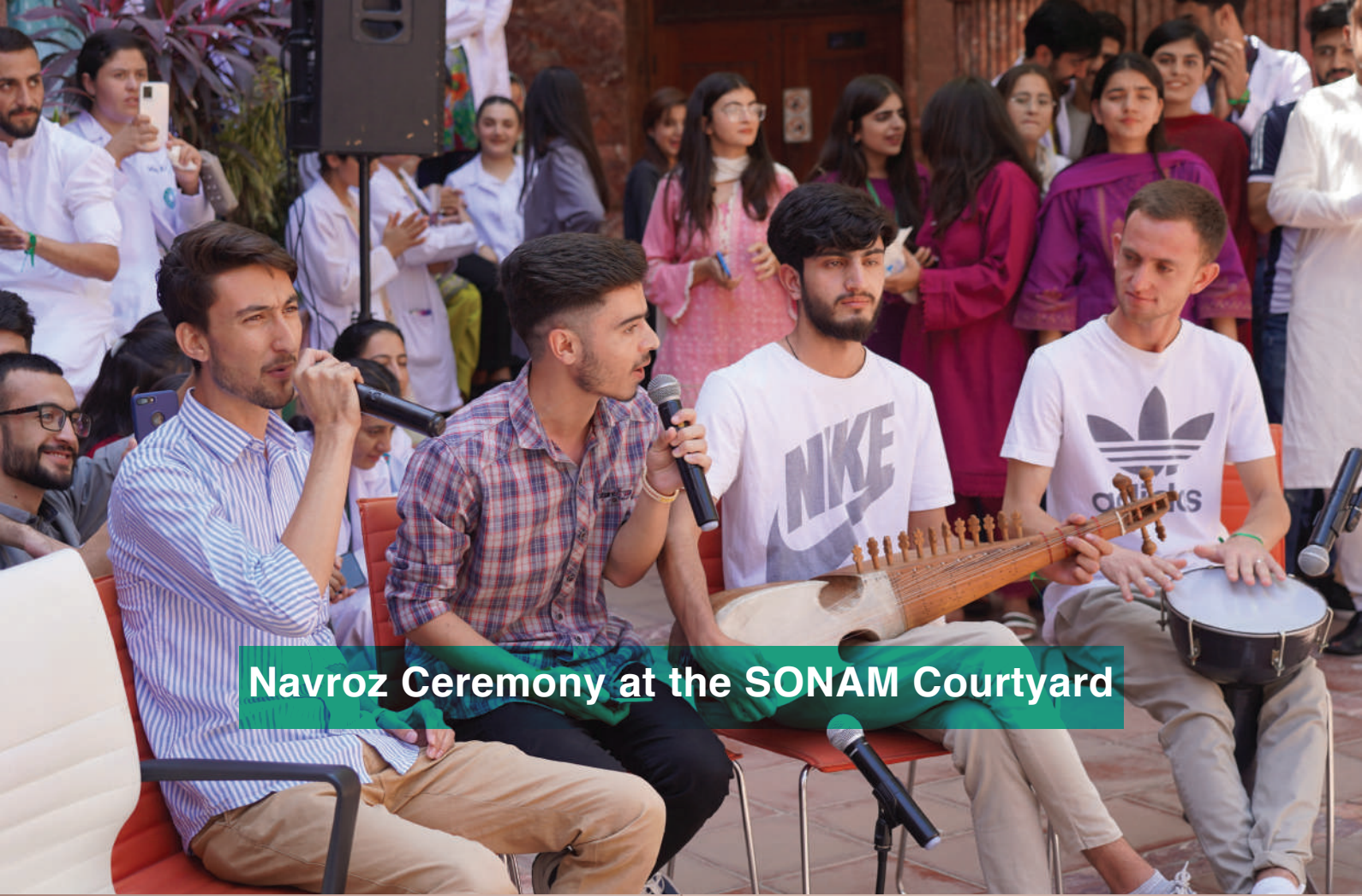
Navroz Ceremony at the SONAM Courtyard