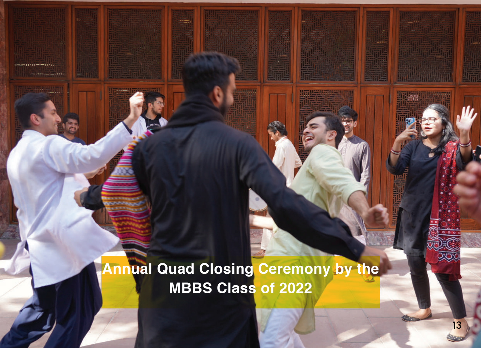
Annual Quad Closing Ceremony by the MBBS Class of 2022