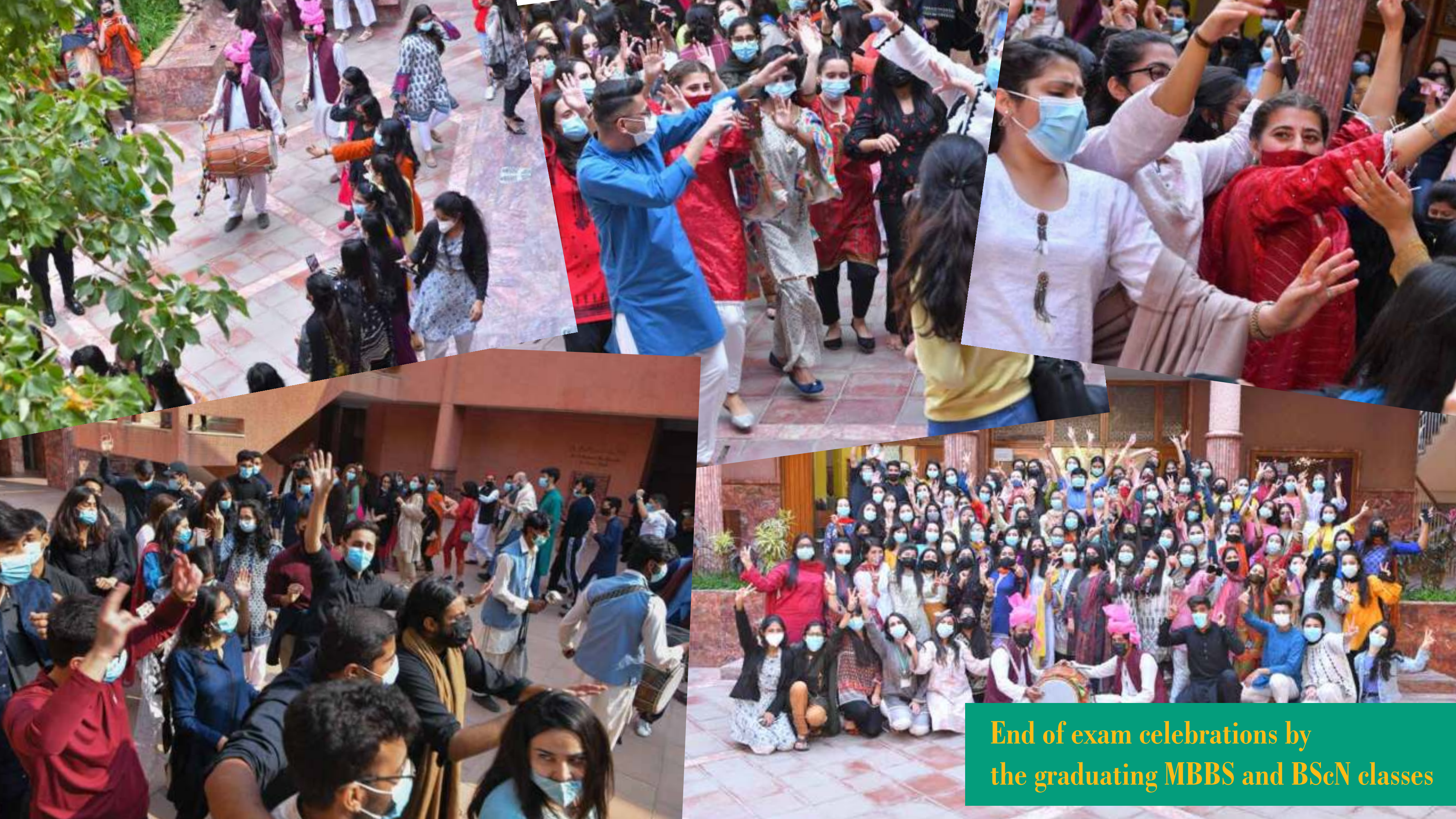
End of exam celebrations by the graduating MBBS and BScN classes