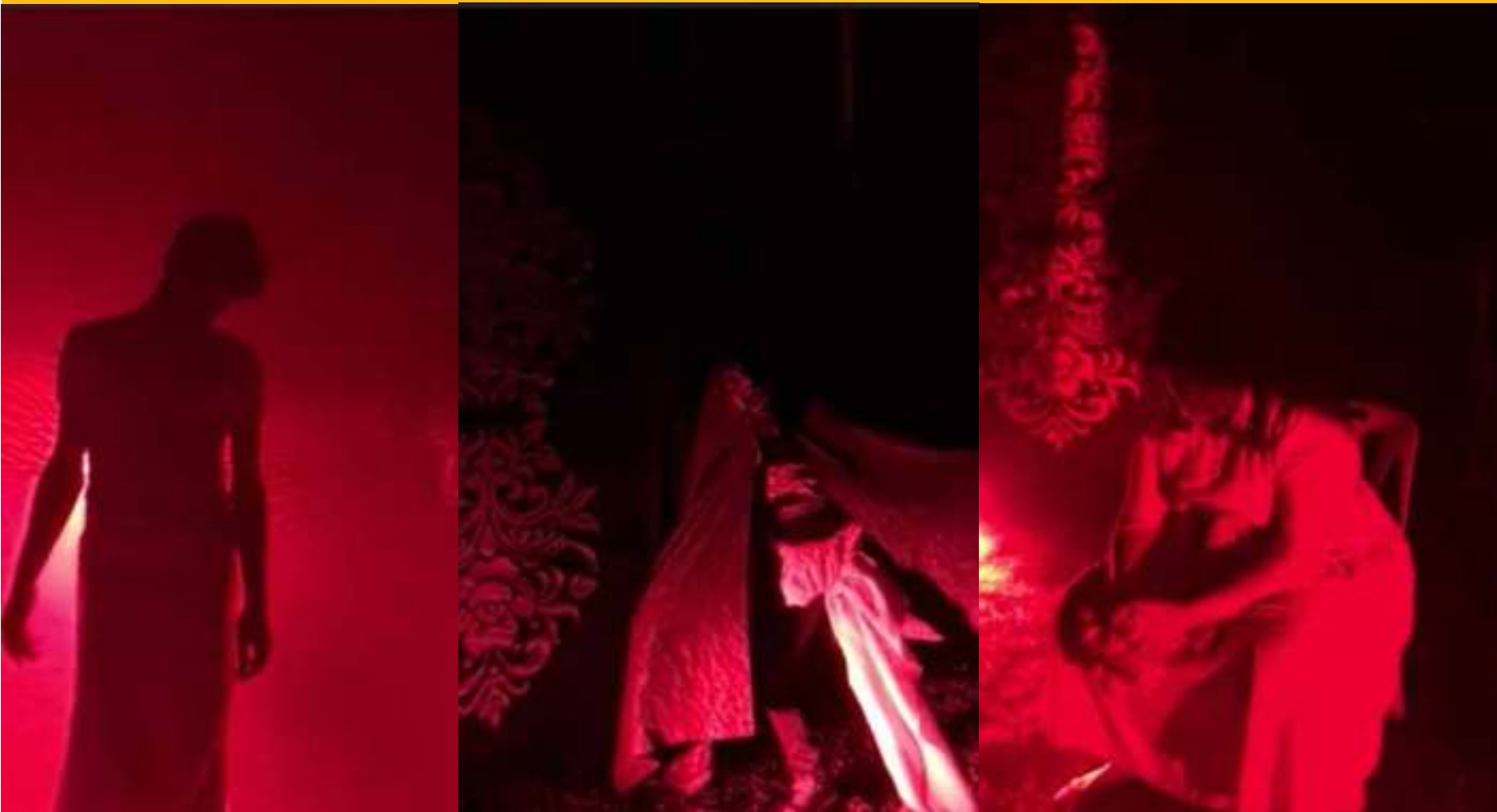
The Arts & Culture committee members from BScN '22 organised a "Haunted House" for all SONAM students. A similar activity "Nightmare" was organised by MBBS '24