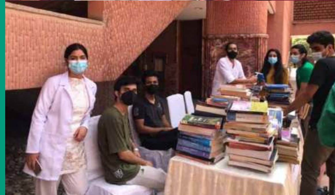
The Synergy Book Fair where senior students donate their medical books to the incoming students