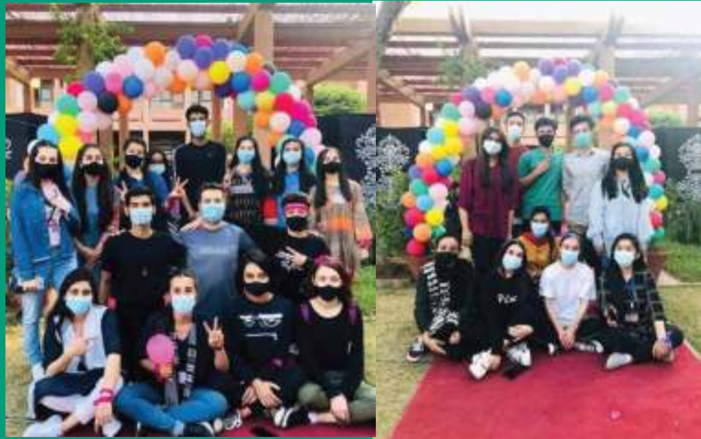
Ice-breaking session for BScN '24 organised by Synergy SONAM