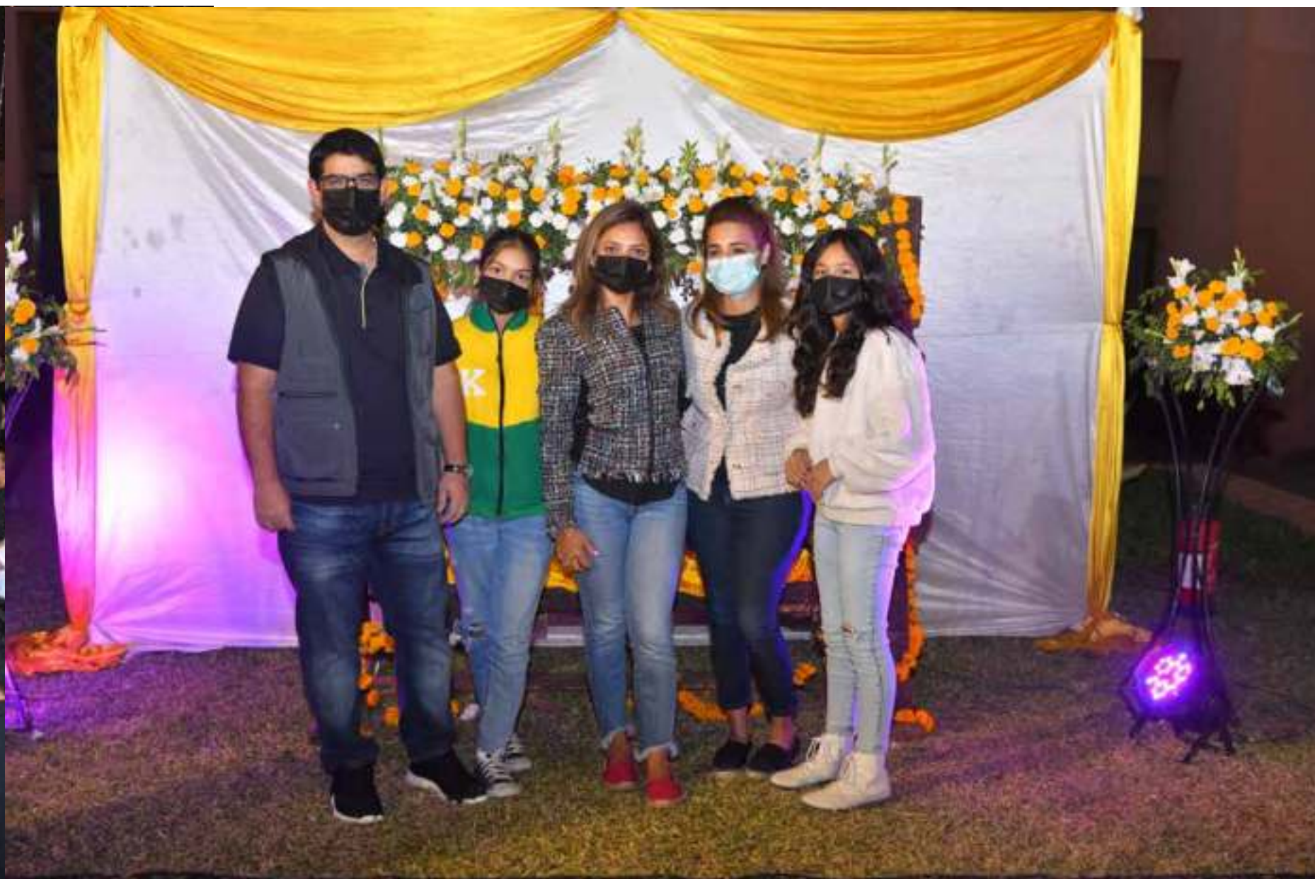
Falah organised their annual fundraising dance event