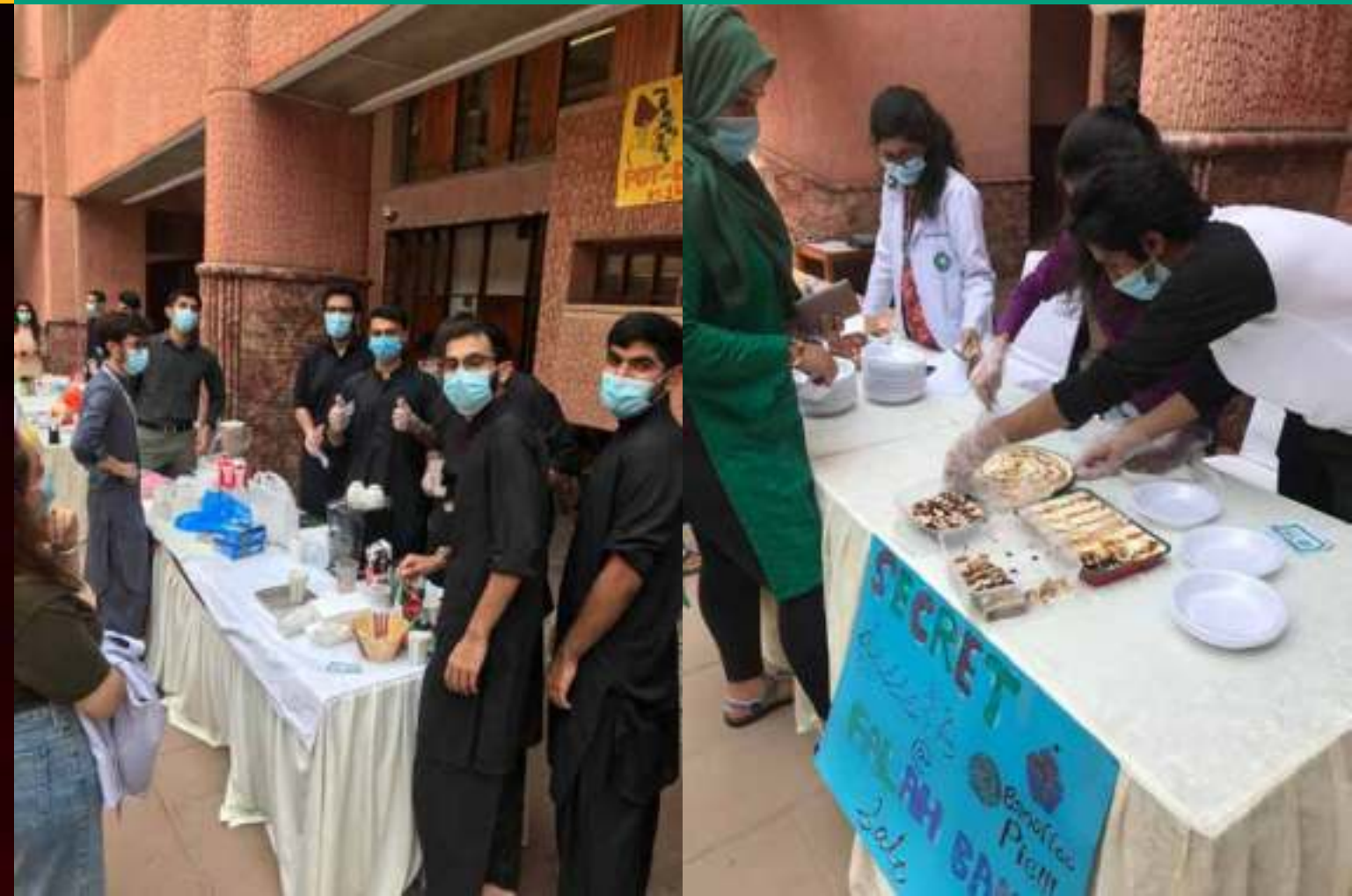
Falah arranged their annual Bake Sale to raise money for their patient welfare activities.