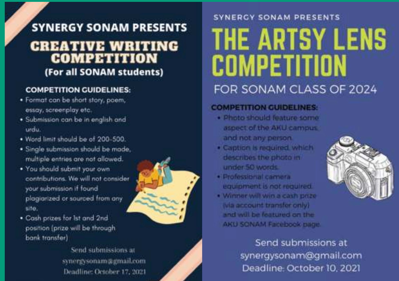
And many other events and competitions!